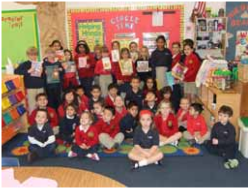
2 nd Grade/Preschool Reading Buddies