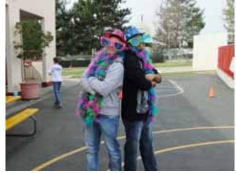
Disco Day Fun