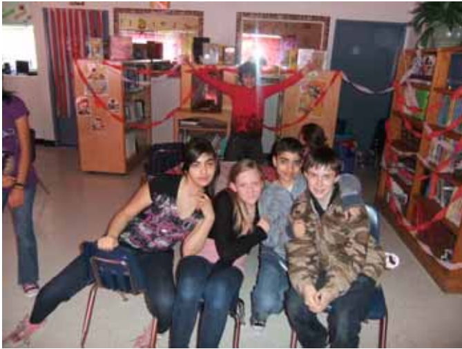
Junior High Valentine's Dance